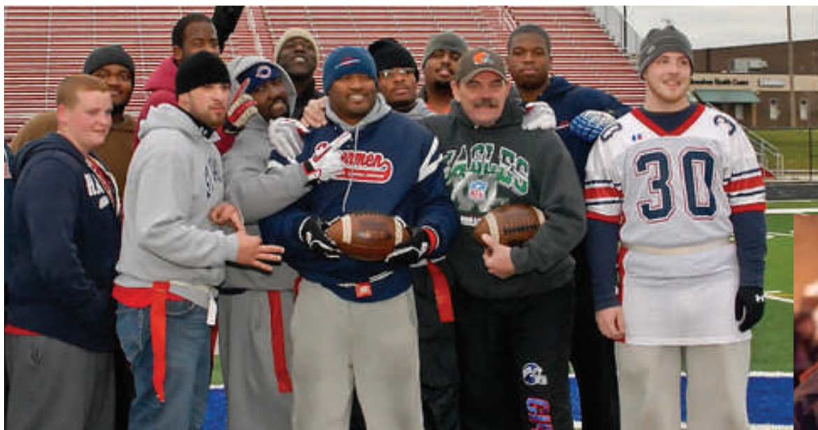
Braving the cold, these participants in the first annual Alumni Turkey Bowl prove Ironmen are #1.