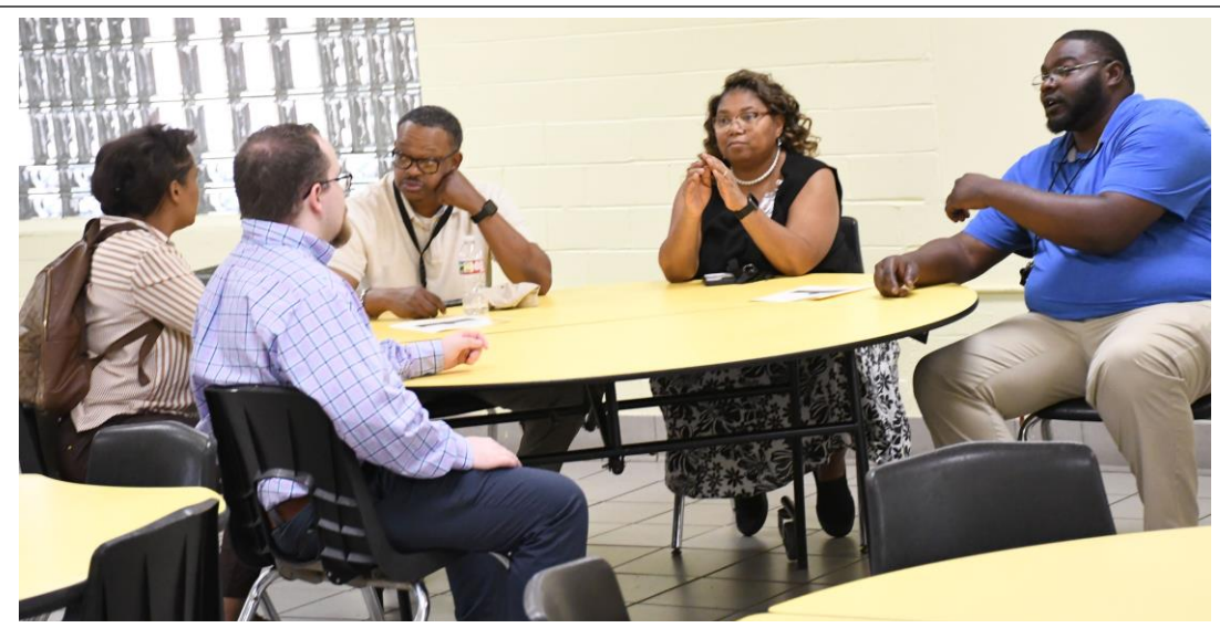
All schools in the Holly Springs School District hosted Back-To-School Nights as the new school year kicked off in August 2024. Pictured are (top, left) Holly Springs Intermediate School; (top, right) Holly Springs High School; (left) Holly Springs Career and Technical Center; (bottom, left) Holly Springs Primary School; and (bottom, right) Holly Springs Junior High School.