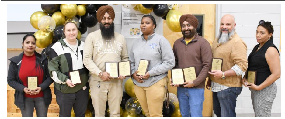
Holly Springs High School special recognitions

‘Give yourselves a standing ovation. You deserve it.’