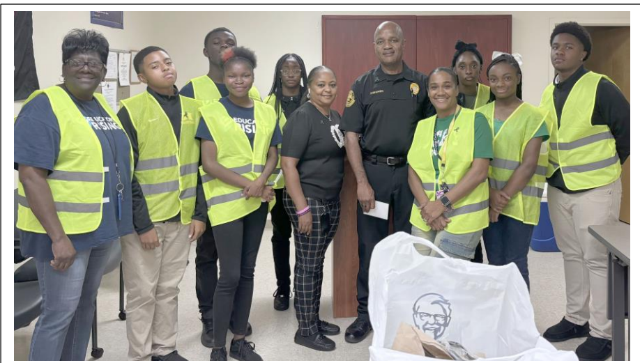
Career and Technical Center – Holly Springs Police Department