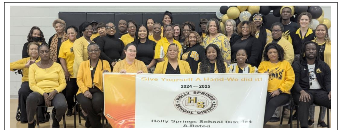
Holly Springs Intermediate School