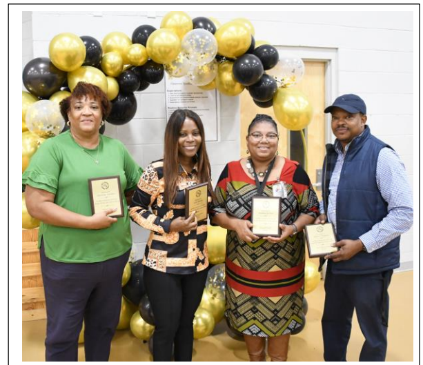
Holly Springs Career and Technical Center special recognitions