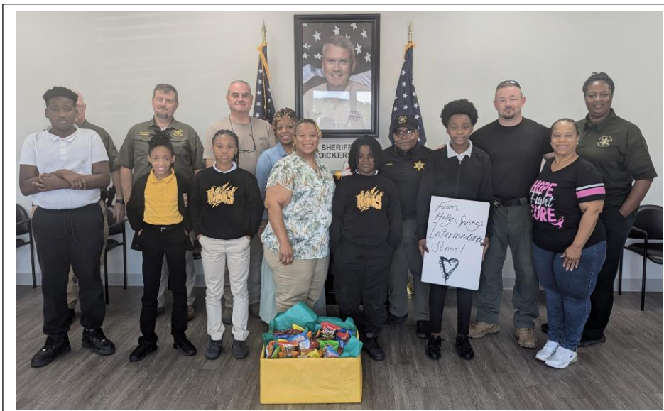
Intermediate School – Marshall County Sheriff's Department