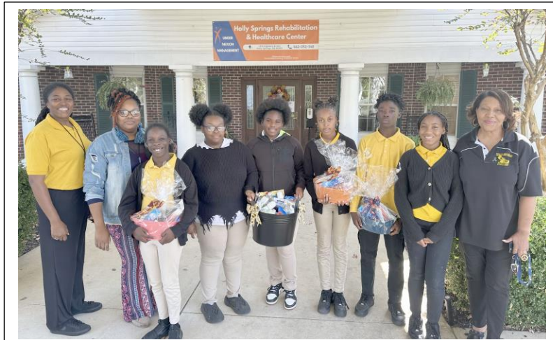
Junior High School – Holly Springs Rehabilitation and Healthcare Center