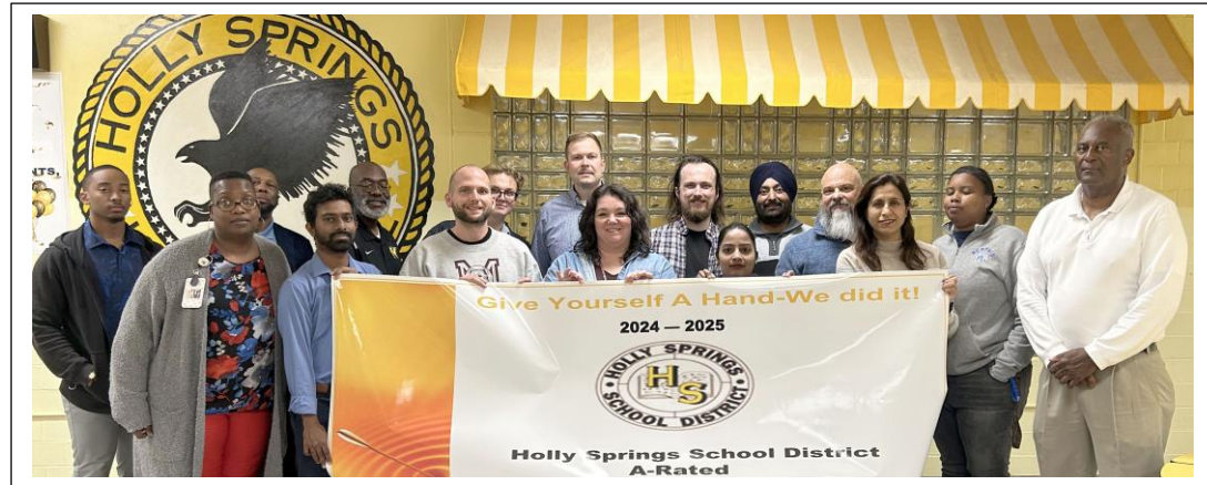
Holly Springs High School

In addition, administrators, teachers and support staff who made significant contributions by reaching or exceeding their goals related to the district’s overall growth and A-Rating were honored.