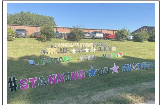
Holly Springs Primary School celebrates its first-ever A-Rating from the Mississippi Department of Education with a huge sign on campus – “History Made.”