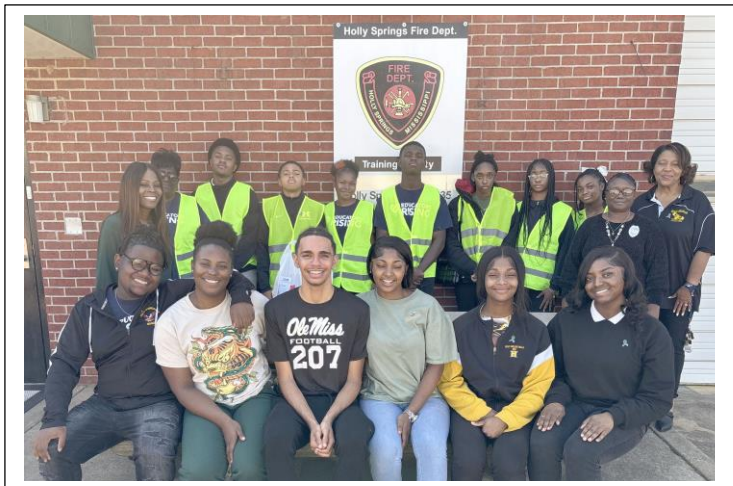
High School – Holly Springs Fire Department