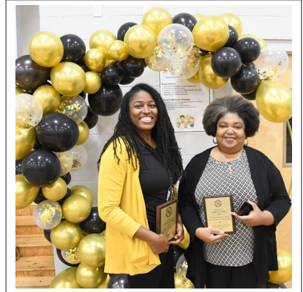
Holly Springs Junior High School special recognitions