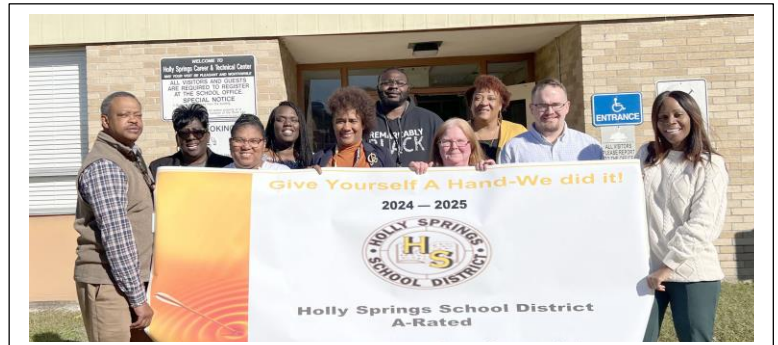
Holly Springs Career and Technical Center