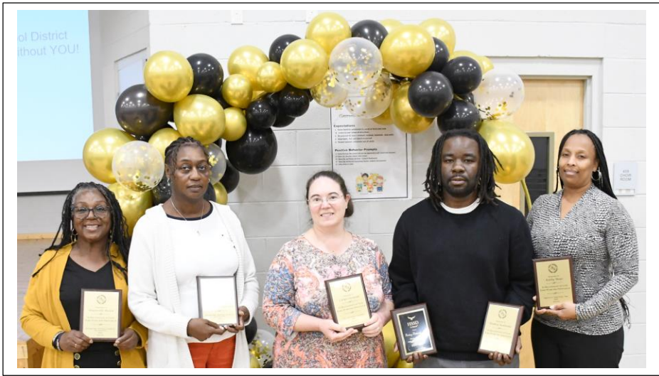
Holly Springs Intermediate School special recognitions