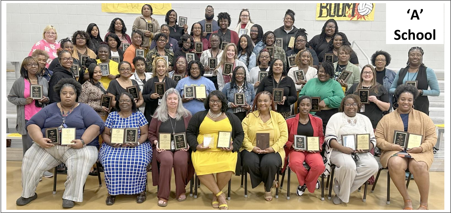
Holly Springs Primary School staff with awards (A-Rated school for first-time ever)