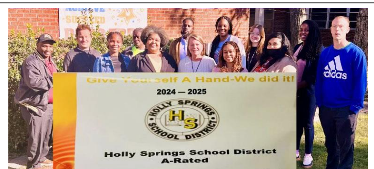
Holly Springs Junior High School