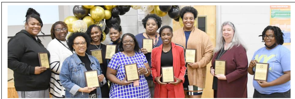
Holly Springs Primary School special recognitions