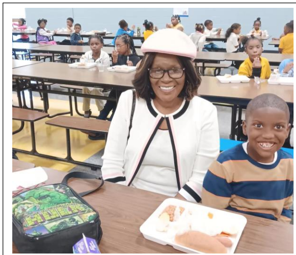
Primary School – Community Lunch