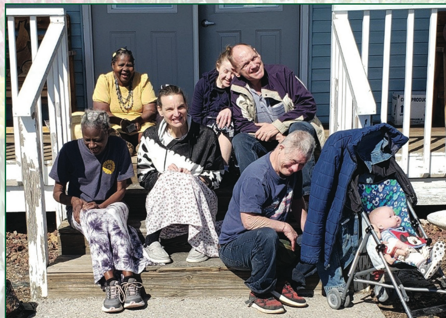
A few of our residents enjoying the beautiful weather!