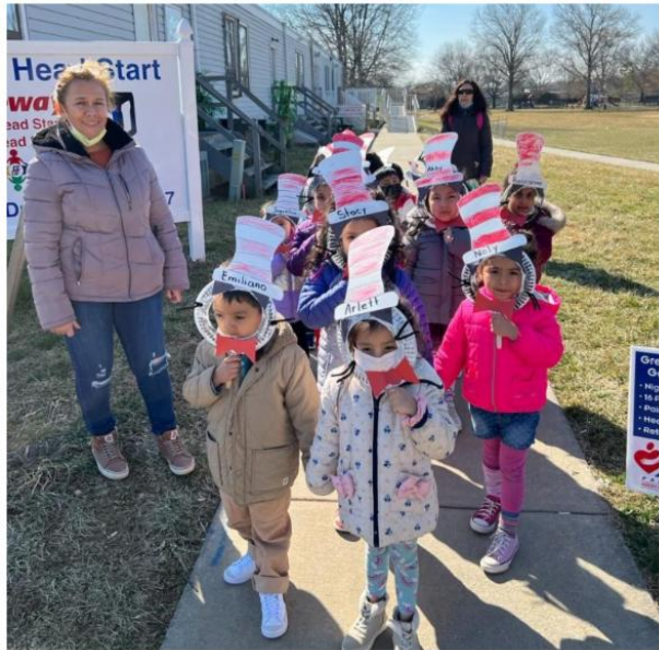
Children and staff from Twin Rivers Head Start marched in a "Crazy Day" parade sporting the "Cat in The Hat" accessories they made in the classroom. The parade took place as a celebration for Dr. Seuss' birthday and Read Across America week.