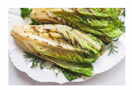
Grilled Romaine Lettuce