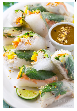
Spring Rolls with Lettuce