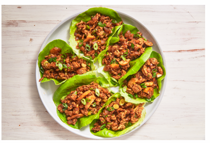
Chicken Lettuce Cups