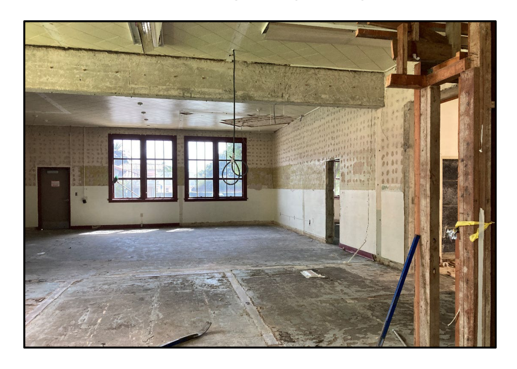
SMHS Admin to Classroom – Demolition of the Interior Continues