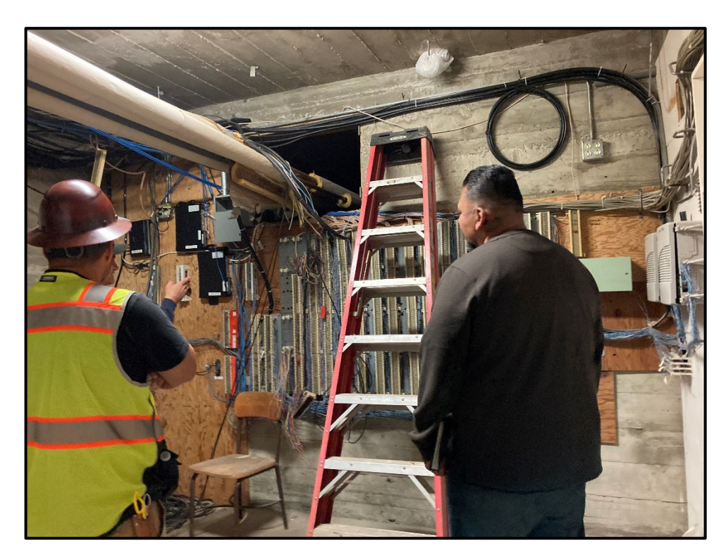
SMHS Admin to Classroom - Subcontractors Reviewing Electrical and Data Layout