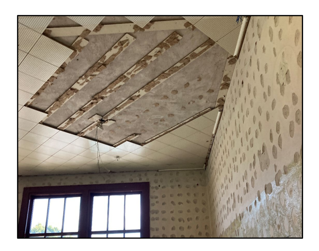
SMHS Admin to Classroom – Removing Ceiling Tiles to Expose Wiring