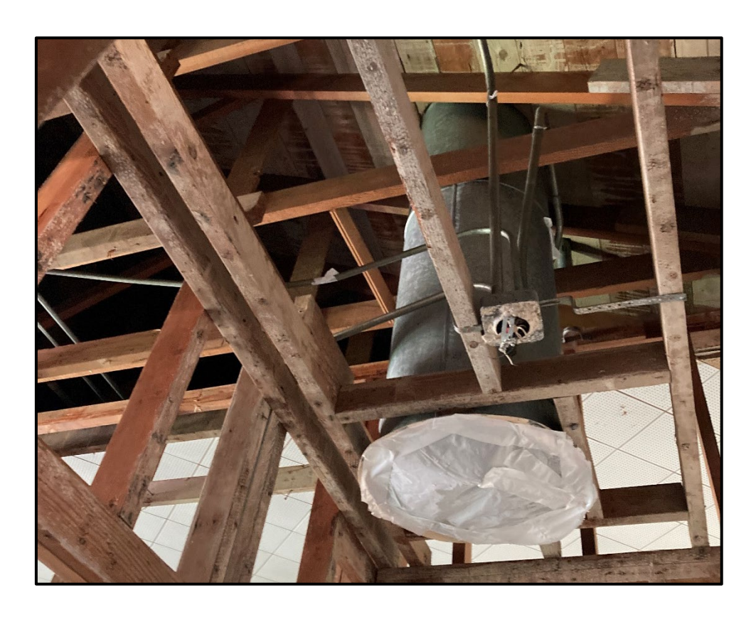
SMHS Admin to Classroom – Exposing Vents for HVAC Installation