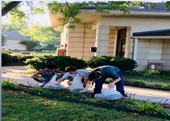
Community Service Project