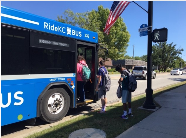
Community Transportation Training