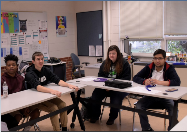
Work Study Classroom