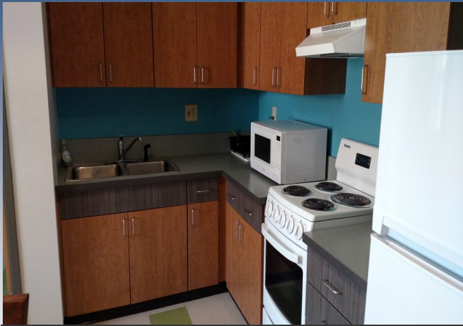
Independent Living Apartment Kitchen Area