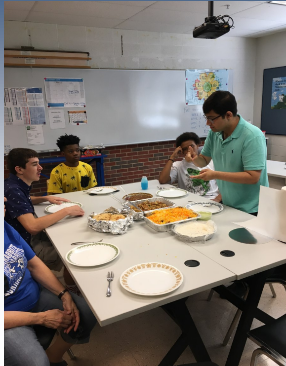
Friday KSTAR Community Lunch