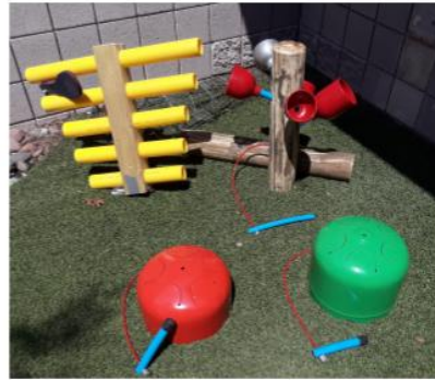
Outdoor musical instruments