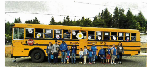
Members of our Booster Club and School Board photographed with Evaline students and their family members in front of our winning parade entry - Winlock Egg Days Parade - June 2023.