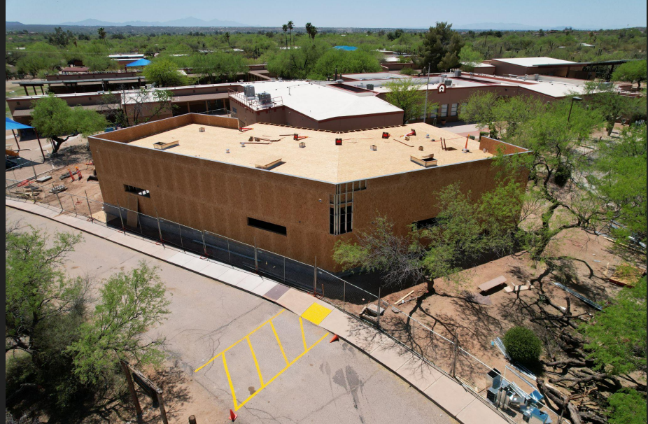
New Kindergarten Building