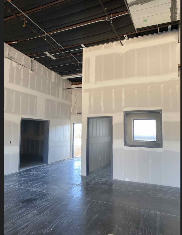
New Fine and Performing Arts Building - Interior