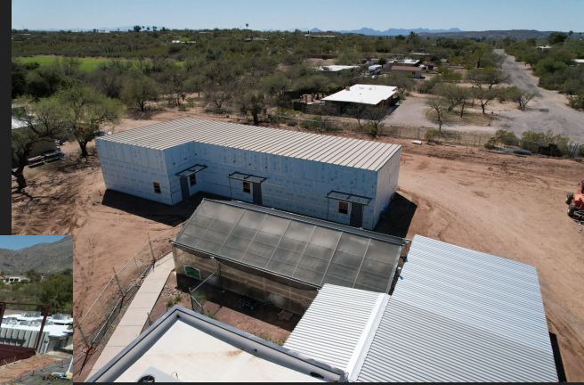
New Science Classroom/Labs Building