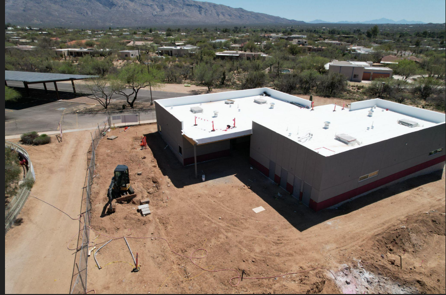
New Kindergarten Building