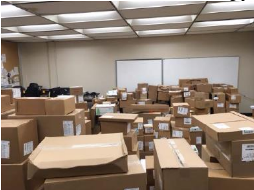
Orders ready to be checked in

These things are all done in addition to our regular daily duties which include processing the bi-weekly payroll, paying bills, depositing money, grant reporting, and keeping the financial records for our new building project.