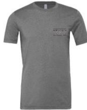
Front of T-shirt