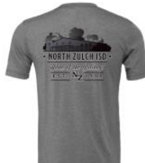
Back of T-shirt

*Light grey, short-sleeved, tri-blended fabric, t-shirt