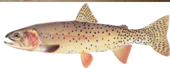
Yellowstone Cutthroat Trout