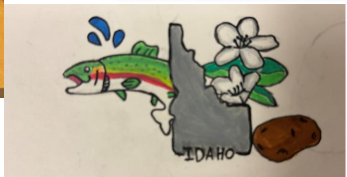
Illustrator: Lily Sweeney