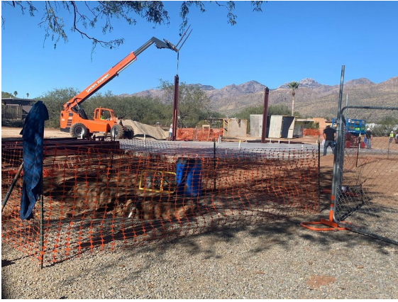
Tanque Verde High School - Science Building framing begins.