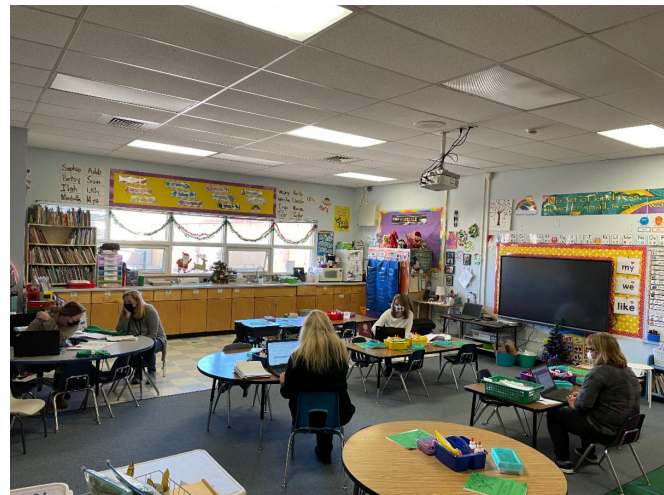
ACES Professional Learning Community Team Collaboration