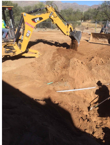
Agua Caliente Elementary School - Kindergarten Building site preparation continues.