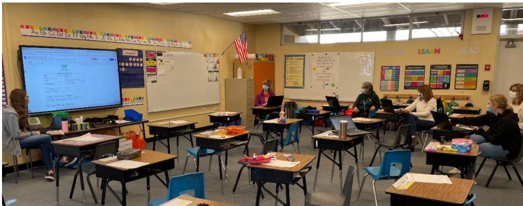
ACES Professional Learning Community Team Collaboration