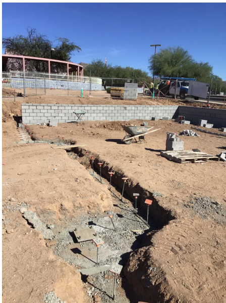
Tanque Verde Elementary School Kindergarten Building site preparation continues.