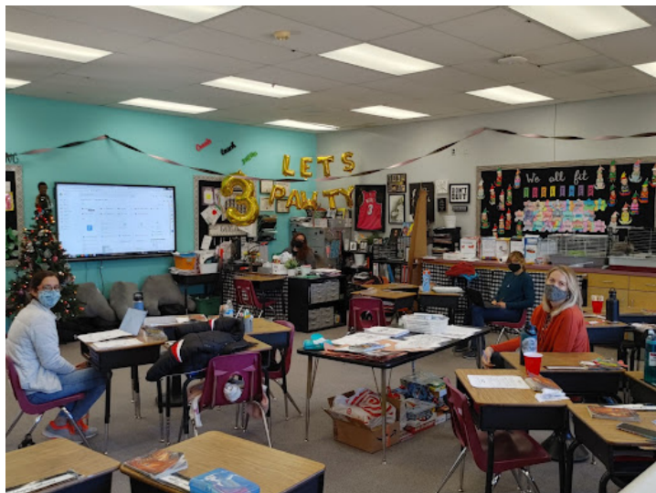
Image - TVES Professional Learning Community Team Collaboration.

We would like to thank our teachers, administrators, and staff members for all the great work they have done this school year to ensure students are learning at high levels. Despite the pandemic period which has challenged students, staff and families, their collaboration and dedication have enabled student progress and increased achievement levels at all grade levels.