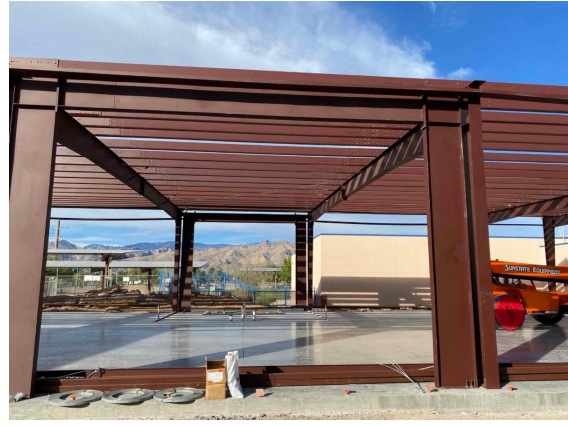
Emily Gray Jr. High School - Fine and Performing Arts Building steel framing continues.