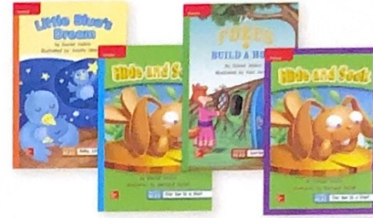
Little Blue's Dream (Approaching), Hide and Seek (On Level, ELL), The Foxes Build a Home (Beyond)