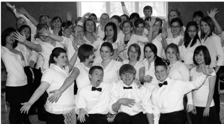
Far left: The servers show their silly side as they wait for the dinner to begin.

Don't miss an issue! Send address changes to advance@nebraskachristian.org