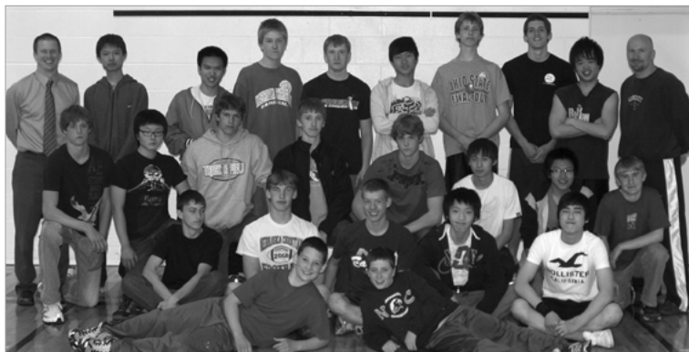
'09-'10 Boys' Basketball.