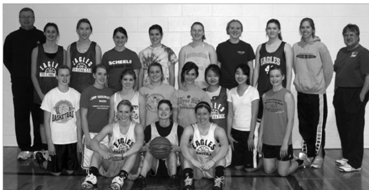
'09-'10 Girls' Basketball.