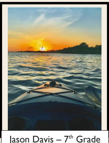
Denton Magnet School