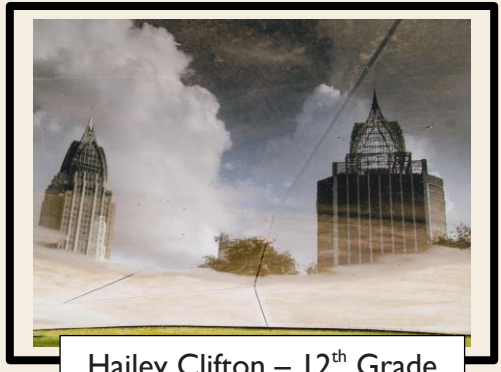
Hailey Clifton - 12th Grade First Baptist Church of Satsuma (Homeschool)