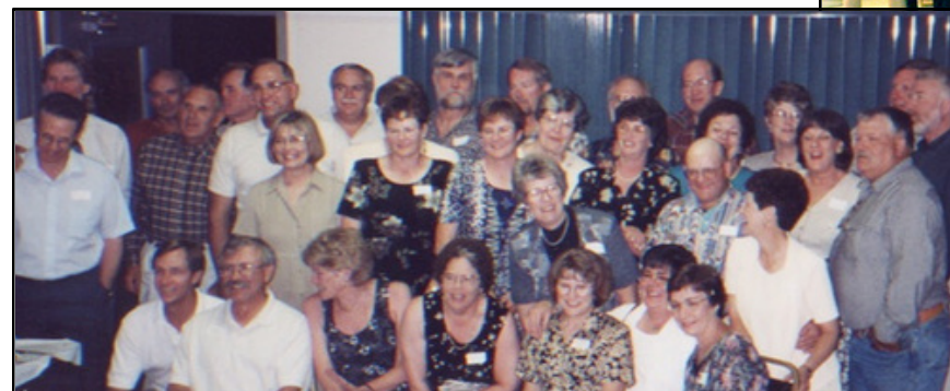
35th Reunion of Class of 1964 in 1999