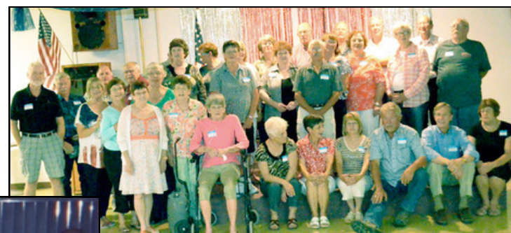
50th reunion of Class of 1964 in 2014