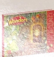
"A Barn Full of Hats" pp. 12-21