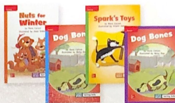
Nuts for Winter (Approaching), Dog Bones (On Level, ELL), Spark's Toys (Beyond)