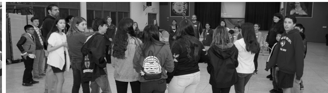
We had about 90 people in attendance! (30 High School and 25 Junior High School Youth, plus parents, Cor Jesu Team leaders, and some children)