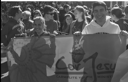
OneLife LA March on 1/20/18