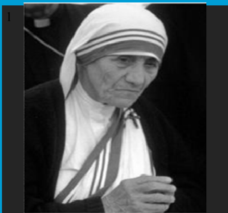
St. Teresa of Calcutta Canonized September 4, 2016 Feast Day: September 5

Vocations: Carmelite: (909) 629-9495 - Archdiocese (213) 637-7515