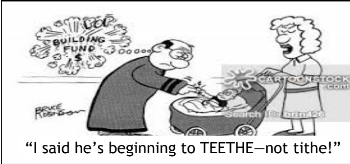
"I said he's beginning to TEETHE—not tithel!"