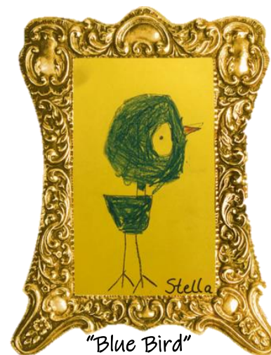
"Blue Bird" Stella Lennox Kindergarten