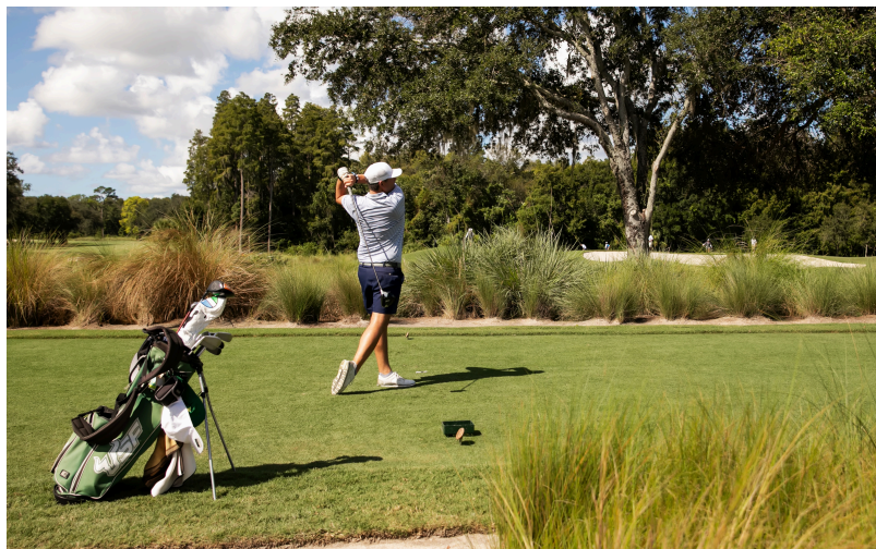
FULL SIZE AD