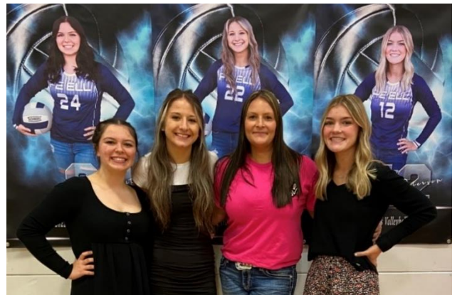
Senior Volleyball Players