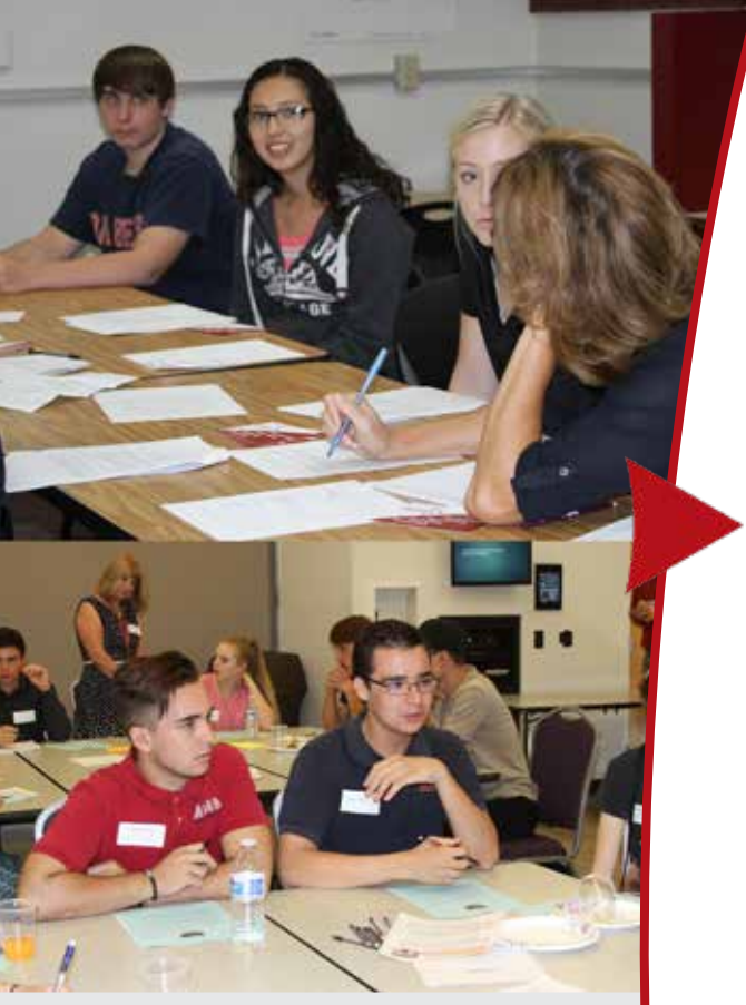
Student participants discuss the challenges facing Arizona's education funding policies in Payson and the Verde Valley.