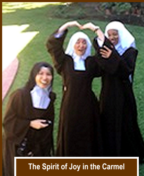
The Spirit of Joy in the Carmel