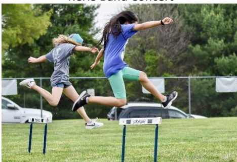
Field Day/D.A.R.E. Day