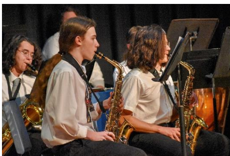
RGHS Band Concert