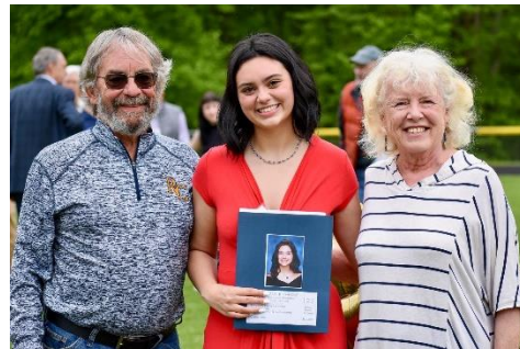
Senior Scholarship Awards Ceremony