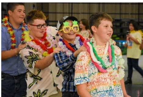
6 th & 7 th Grade Dance