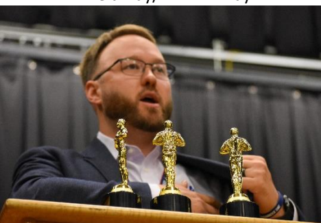
RGHS Academic Awards Ceremony