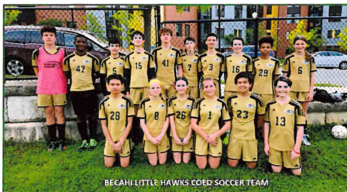
BECAHI LITTLE HAWKS COED SOCCER TEAM

(Bring your water bottle, soccer cleats and shin guards. Turf is located behind the grass soccer field)