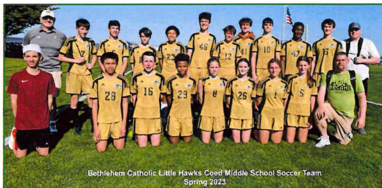
Bethlehem Catholic Little Hawks Coed Middle School Soccer Team Spring 2023

COME AND HAVE FUN PLAYING SOCCER WHILE MEETING YOUR FUTURE HIGH SCHOOL CLASSMATES!