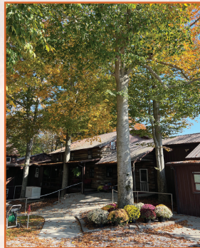
Fall Scene Main House