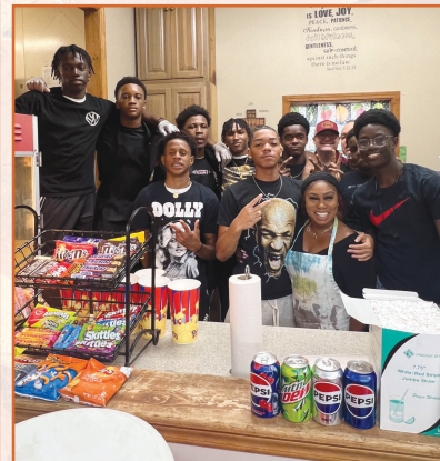
Boarding School Working Concessions