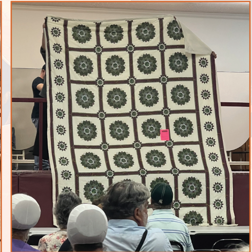
Green Dresden Plate pattern