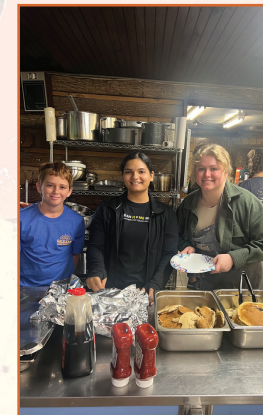
Thankful for our Volunteers