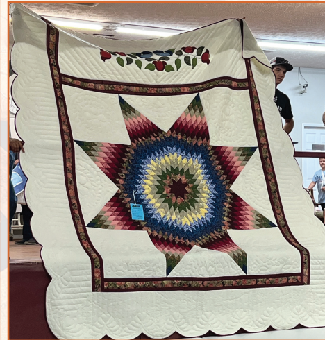
Top Seller – The Lone Star