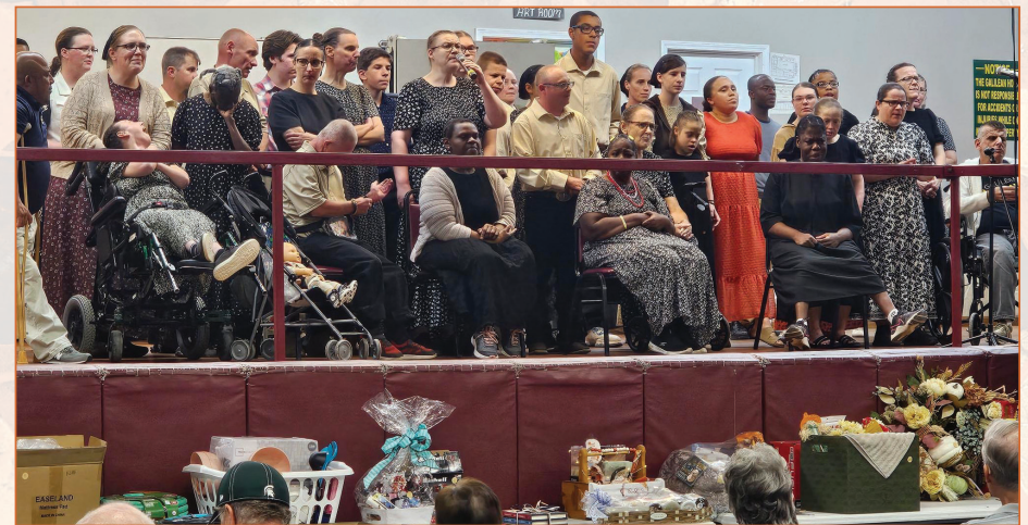
Our Residents during the Friday Night Program

Saturday started bright and early with our traditional pancake breakfast before we rolled into the big event: the quilt auction. With over 150 quilts, we were amazed at the craftsmanship and creativity that poured in from all across the country. These quilts were more than just blankets—they were works of art, each one unique in design, color, and size. Watching them go up for auction was a treat for the eyes and a reminder of the generosity of so many who support this ministry. And, of course, the baked goods table was a feast in itself! Homemade cookies, pumpkin breads, pies, and cakes stretched down the table, making it hard to resist grabbing a little something sweet. The fellowship we shared throughout the day, with quilts being sold and bellies being filled, made it one to remember.