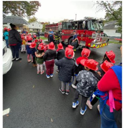
Local firefighters visited students at Hamilton 1 Head Start for Fire Prevention Month this October. Students lined up in hard hats to see the fire truck and learn fire safety.