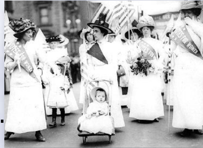
New York march to support women's suffrage, 1912.