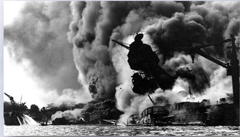
The USS Arizona burns after an attack by Japan on Pearl Harbor, HI (1941).