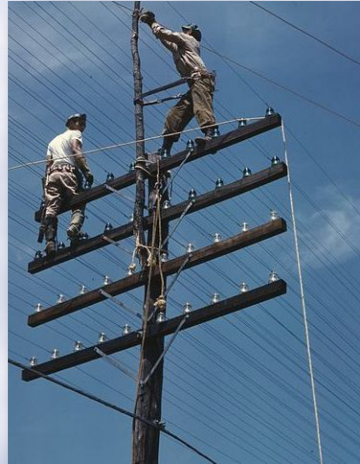
Workers install power lines for the TVA (1944).