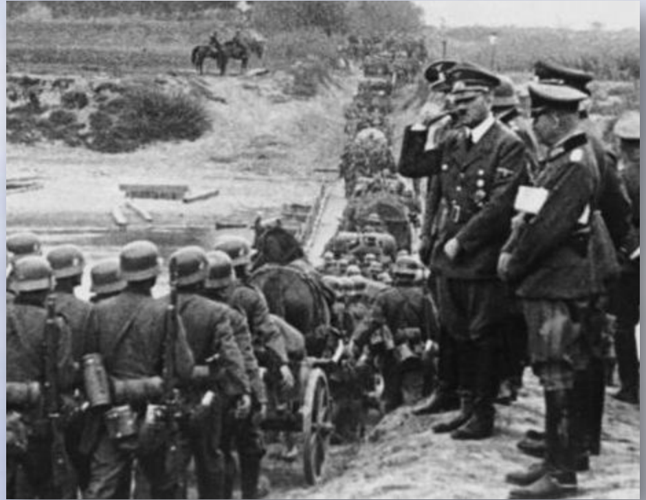
German leader Adolf Hitler watches as his troops invade Poland (1939).