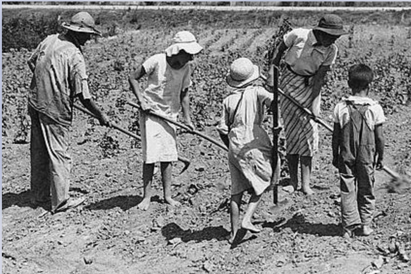
Tenant farming family near Anniston, 1936