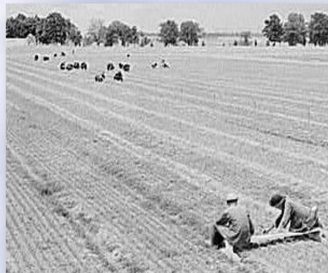
CCC workers planting trees in Alabama, 1942