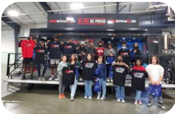
Perry High School Students