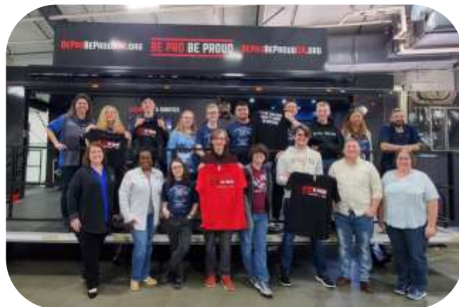
Houston FIRST Robotics