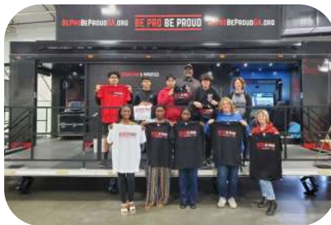
Houston County High School Students