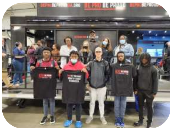
Northside High School Students