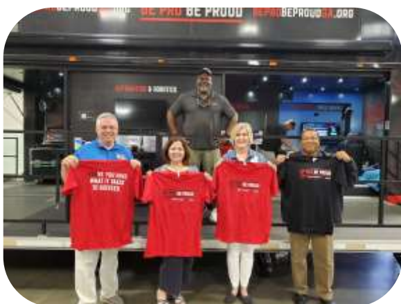
Be Pro Be Proud Volunteers