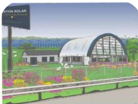
Houston Solar's Future Commercial Breeding Facility Artistic Rendering: View from Southbound I-75