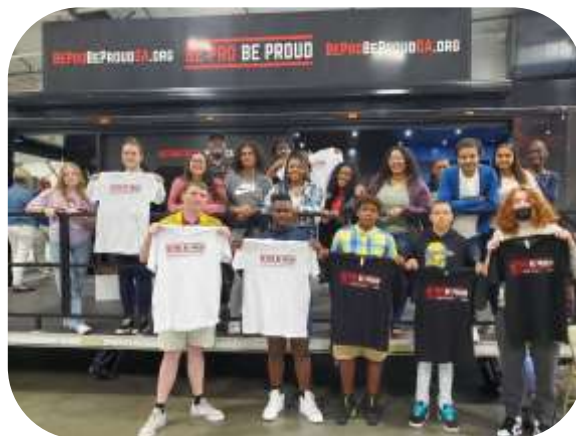
Perry High School Students