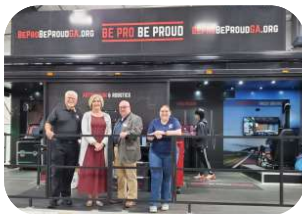
Be Pro Be Proud Volunteers