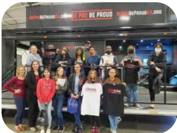
Warner Robins High School Students