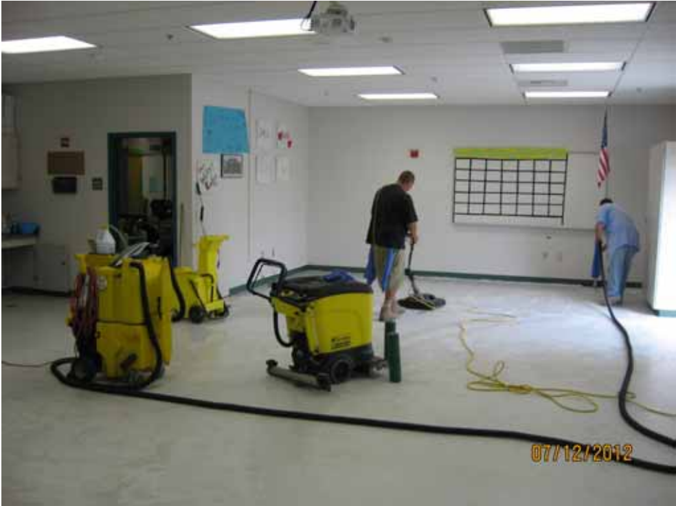
Deep Cleaning Hard Floors – Safely and Efficiently