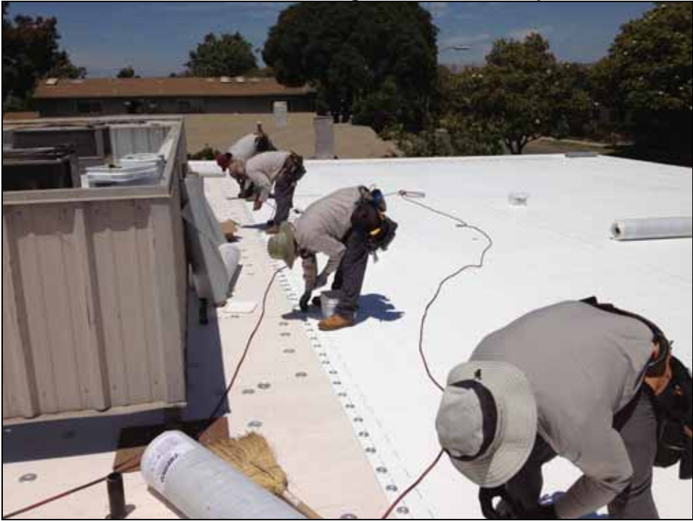
SAPID Roof is Replaced with an Insulated Single Ply Membrane