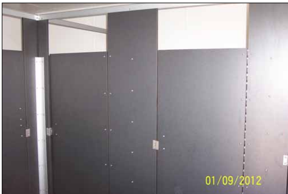
New Phenolic Partitions Installed in SMHS Restrooms