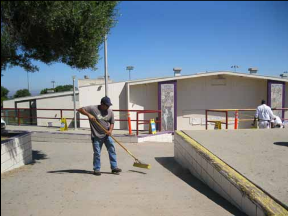
Greek Theater Columns, Handrails, and Block Walls Repainted School Colors