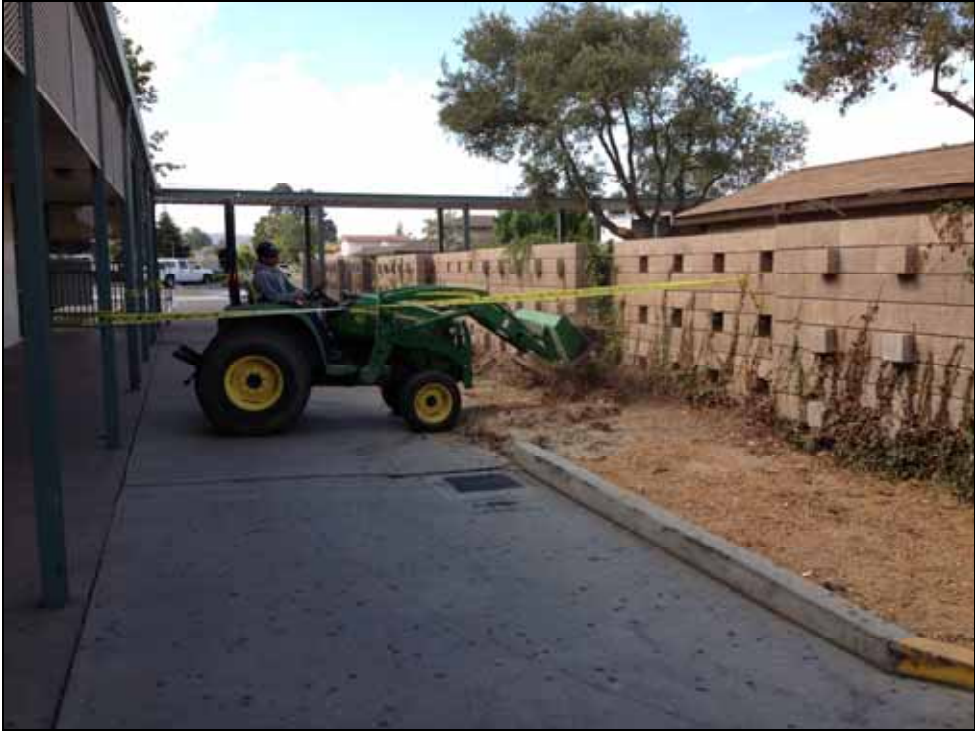
Planter Revisions Begin Between the RHS Library and the Cafeteria Patio