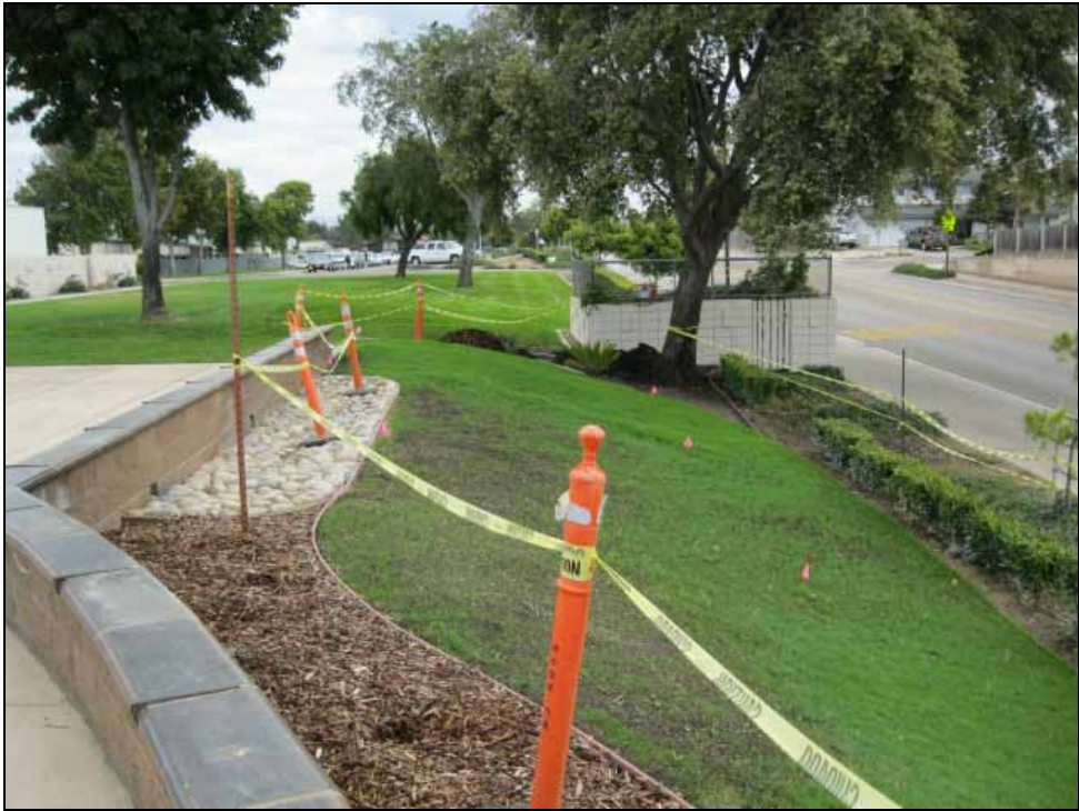
New Landscape in Front of RHS