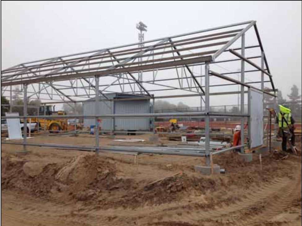
Righetti Greenhouse Framing is Complete