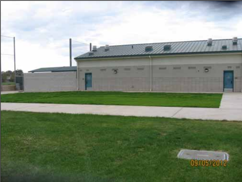
PVHS Pool Area Receives New Lawn