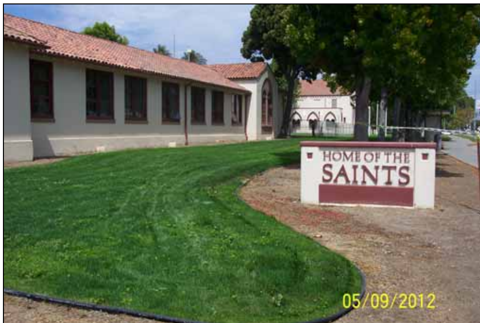
New Lawn in Front of SMHS Administration – Border Plants to be Installed Next