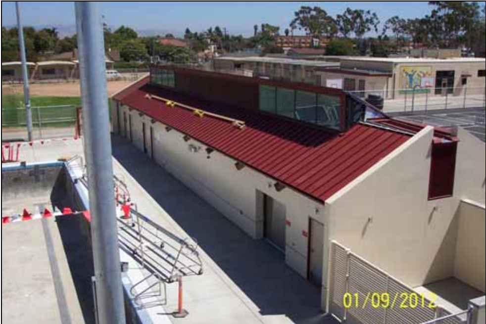
SMHS Pool Building Metal Roofs Nearing Completion