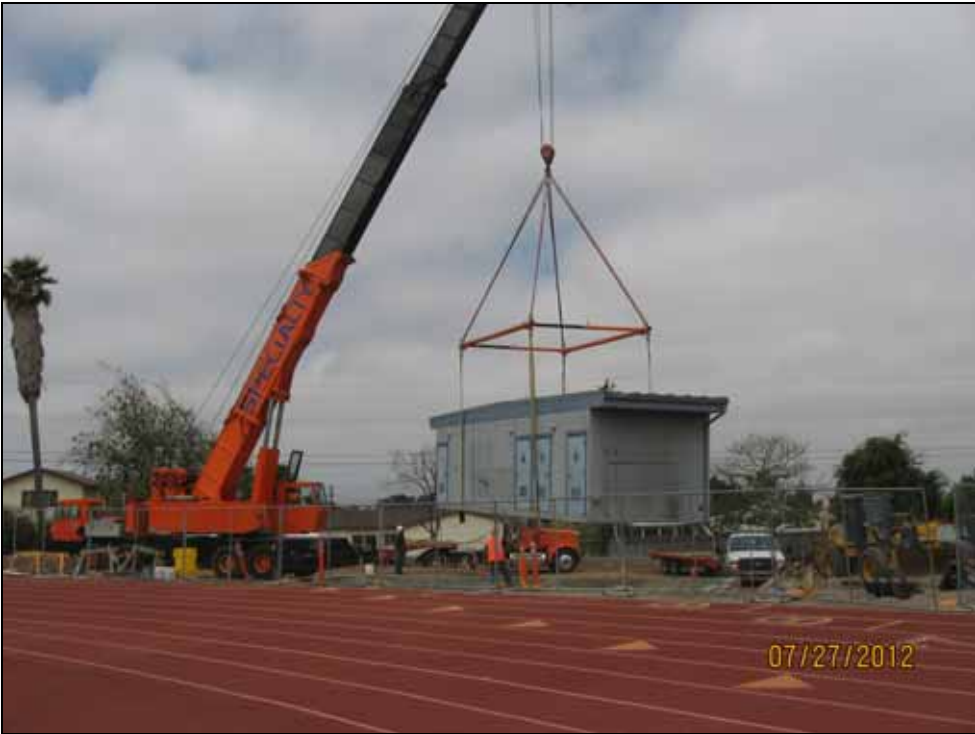
Righetti Greenhouse Area Restroom is Set in Place