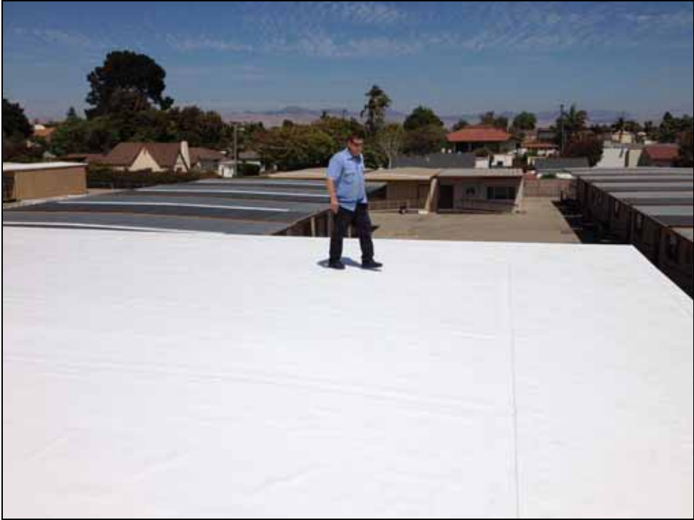
SMHS Dance & Dram Building New Roof Final Inspection