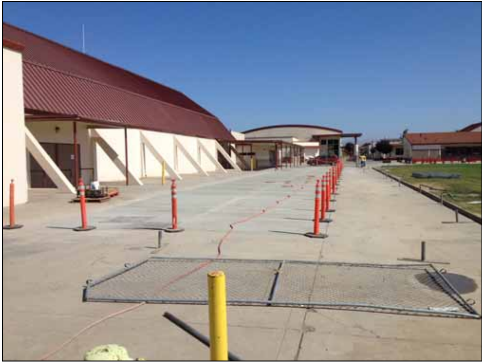
New Concrete Poured in Front of Wilson Gymnasium