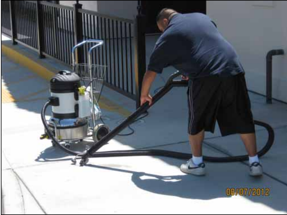
Gum Cleaning Experiment at DHS