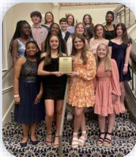
Honor Roll with Distinction Award