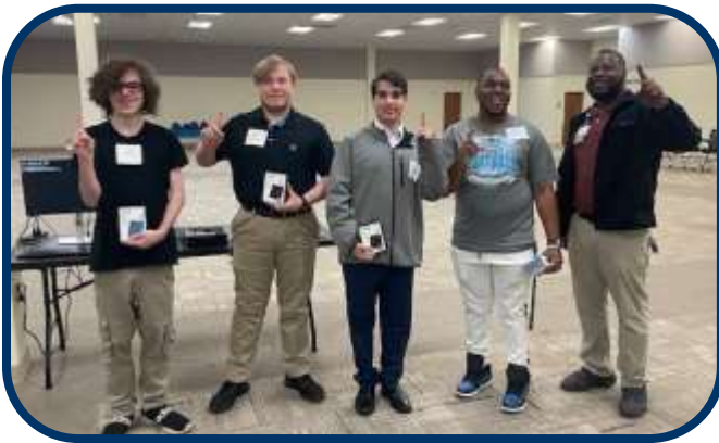
Winners of Computer Building Challenge