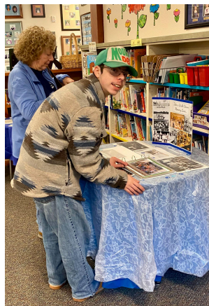
Current Evaline Students leading the Evaline Song.

We still sing this song each month at our Lion