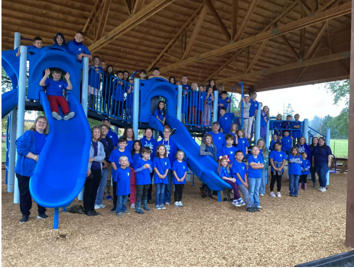
Evaline students and staff gathered around our new playground!