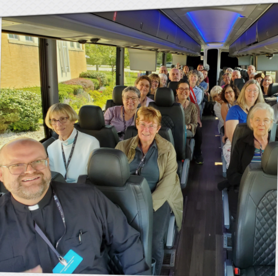
Pilgrimage to Greece