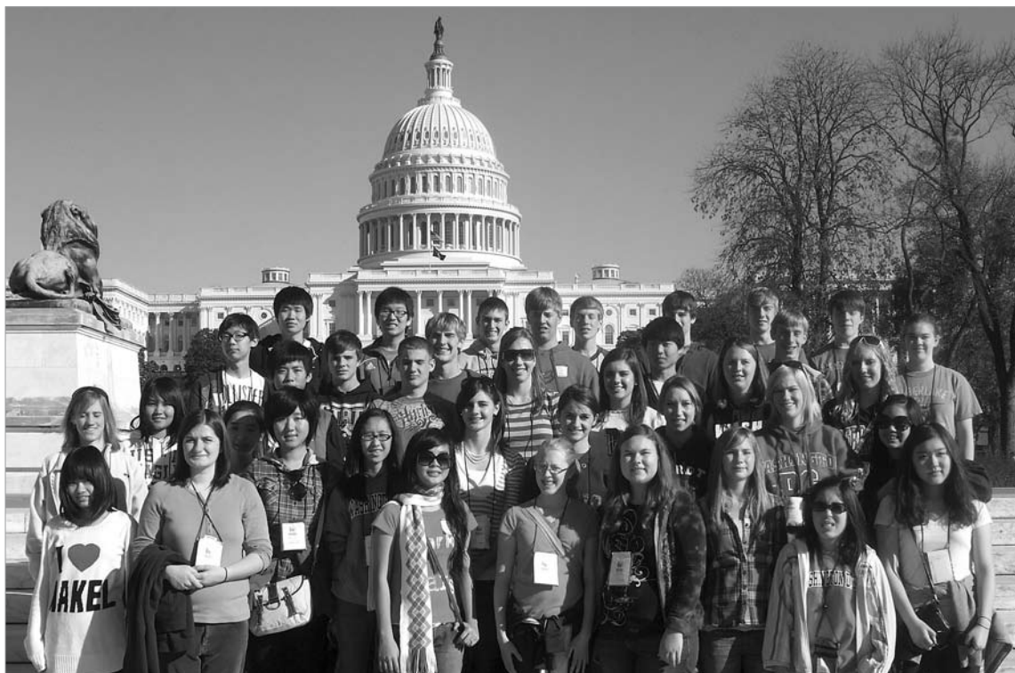
Above: The DC trip group pauses for a picture in front of the US Capitol. The group, which included 47 students and sponsors, spent four days in November touring the Washington, DC area.