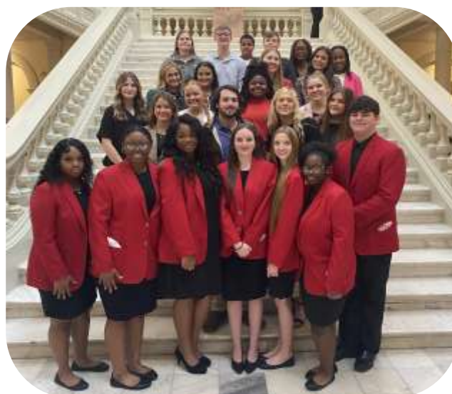
Students are pictured at FCCLA Day at the Capitol.