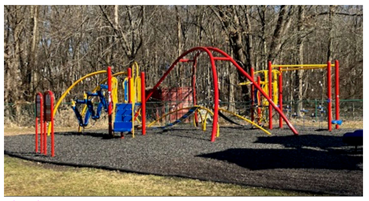
Thanks to the PTO and generous donors, CRS has added an addition to the existing playground.