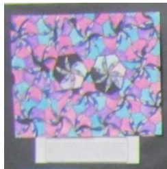
Wheel of Fortune