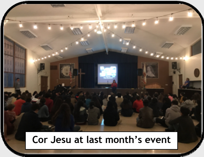
Cor Jesu at last month's event

Also join us on Sunday, February 15, for our Service Outreach to pray in front of Planned Parenthood. See Page Three for details.