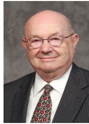
Jimmy Baker The Alabama Community College System Chancellor