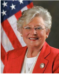
Kay Ivey, Governor President