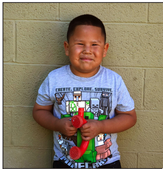
Weston Nez Preschool