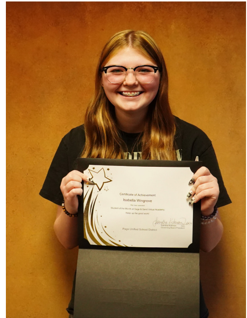
Isabella Wingrove Sage & Sand Virtual Academy