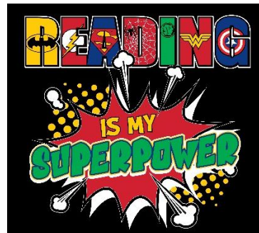
Back Design/Quote: Reading is My Superpower