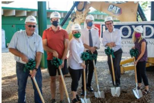
TVUSD Governing Board Members & Superintendent