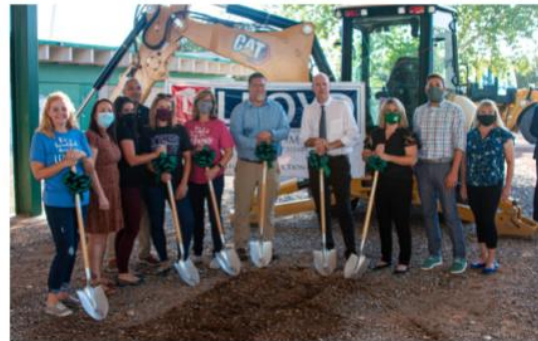
TVUSD Leadership Team