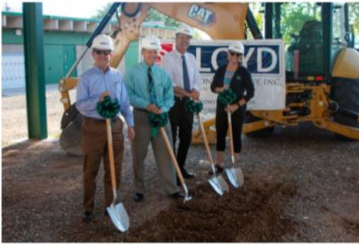
Swaim & Associates Team