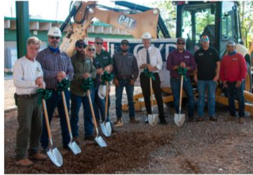
Lloyd Construction Team