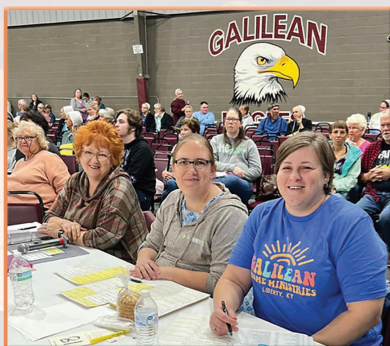
A few of our wonderful staff