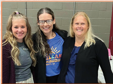
The Office Ladies