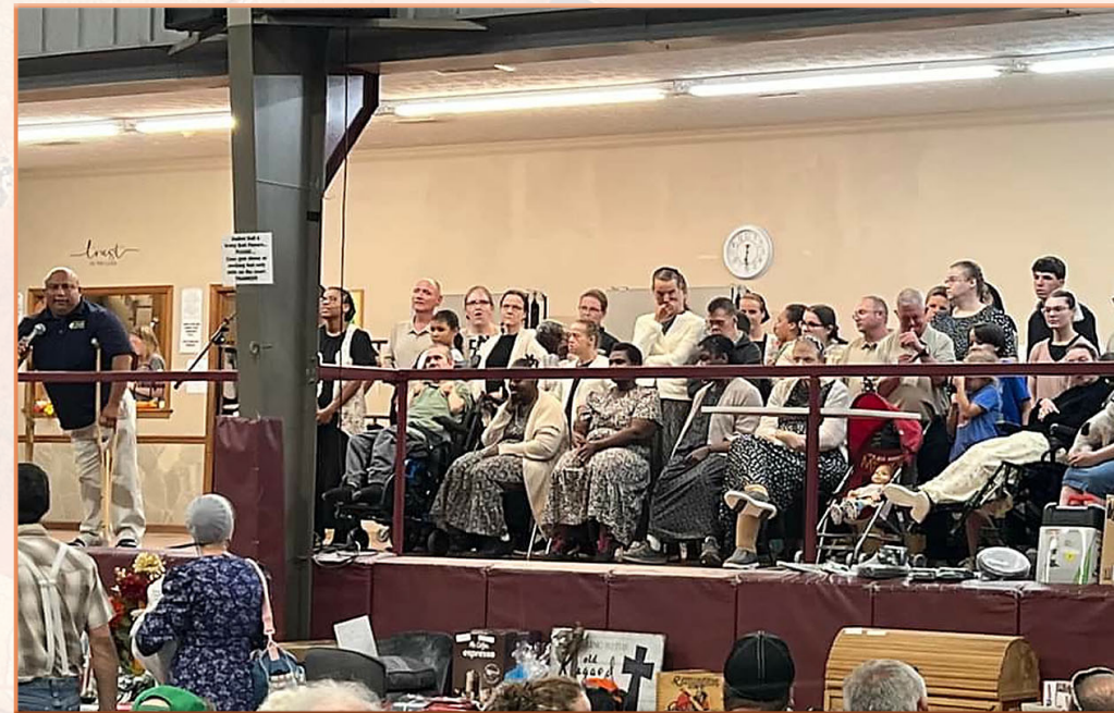
Our Residents during the Friday Night Program