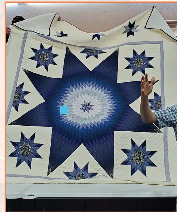
The Lone Star Quilt