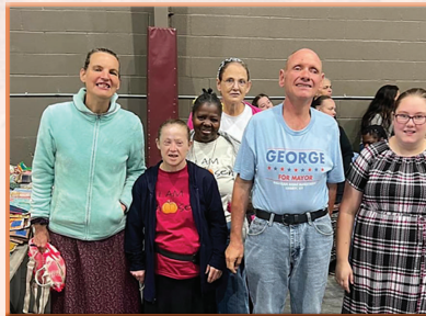
Enjoying the Auction