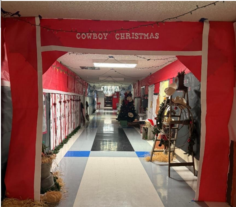
Sophomore class wins with Cowboy Christmas.