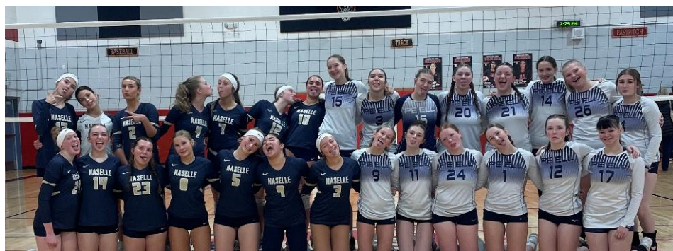
Our Trojan volleyball team on the right, ham it up for the camera with the Naselle team on the left.