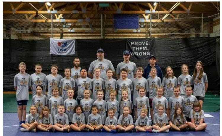
Our youth wrestlers for 2024 - 2025.