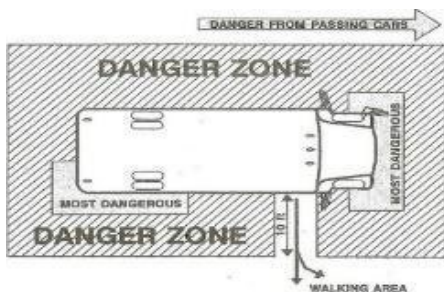
Diagram shows danger zones of the bus.