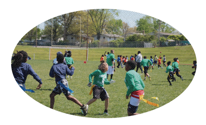
Ready, Set, Go