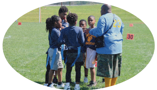
L & C Team Huddle

All proceeds benefit the Riverview Gardens High School football program.