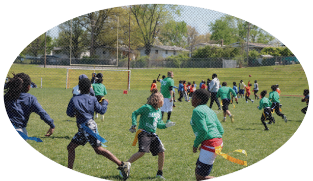
Ready, Set, Go